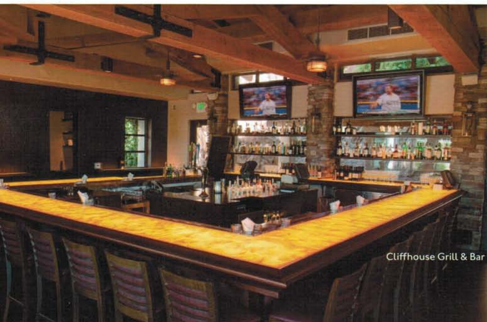
Cliffhouse Grill & Bar

salads, including the Desert Willow Cobb. You'll also find sandwiches—even the classic Monte Cristo—as well as burgers, fish tacos, a healthful Veggie Napoleon and signature dishes including Lobster Mac and Cheese, which comes topped with bread crumbs, along with a side of walnut pear salad. 38-995 Desert Willow Dr., Palm Desert; (760) 346-7060; DesertWillow.com.