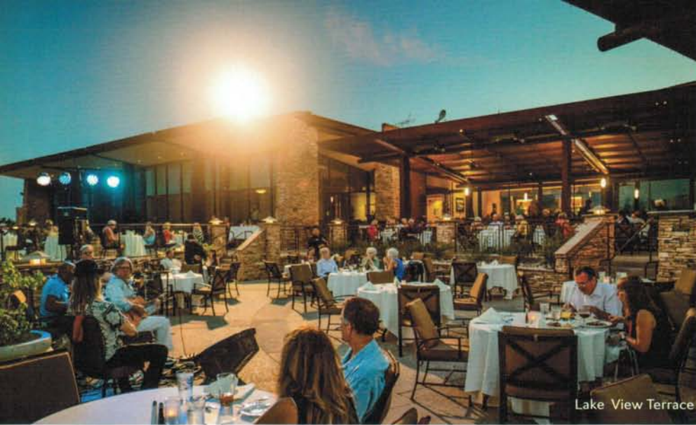
Lake View Terrace